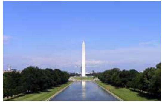
The quintessence of Washington DC is illustrated by the Washington Monument and the Reflecting Pool on the National Mall, at once grand and starkly elegant.