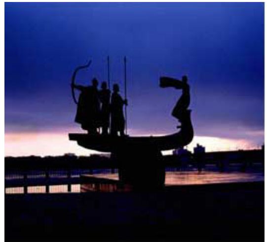
The statue of Kyiv's founders, a city landmark, is dramatically lit at sunrise.