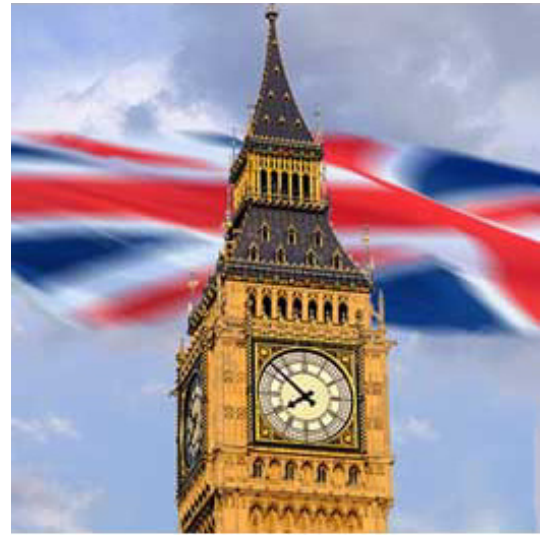
A juxtaposition of St. Stephen's clock tower and the Union Jack, two eminently British symbols.

Alternatively, Western European manufacturers may be able to cut costs considerably by moving production capacity to the accession countries, either through greenfield investments or joint ventures.