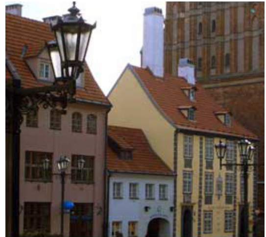
As Latvia moves into a new era of development, its old-world charm is still very much apparent in the capital city of Riga.

Despite all the hyperbole, significant business deals are being consummated in the Baltics with Russian interests and vice versa. The acquisition of Mazeikiu Nafta by Yukos, Estonian Railways' successful ventures in Russia, and Latvian dairy producers aggressively targeting the Russian market are just a few examples.