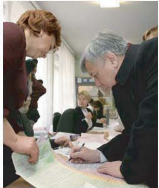
Above: Prime Minister and Our Ukraine party member, Yuriy Yekhanurov, completes his ballot in Kyiv, where all of the officials elected to the Verkhovna Rada on March 26th will come together to determine the direction of Ukraine.