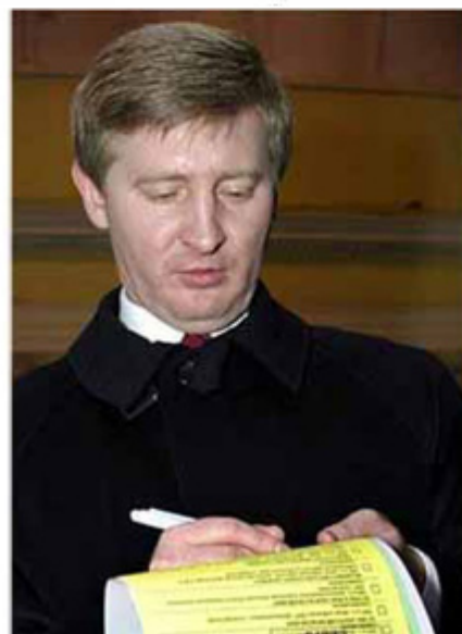
Below: Renat Akhmetov, Ukrainian coal and steel oligarch and Party of Regions supporter, completes his ballot. He is Number 7 on the party list of former prime minister Viktor Yanukovich.