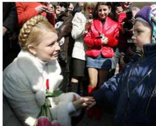
Below: Yulia Tymoshenko, whose eponymous political bloc proved the most popular among "orange" voters, holds the hand of a future constituent in Dnepropetrovsk.