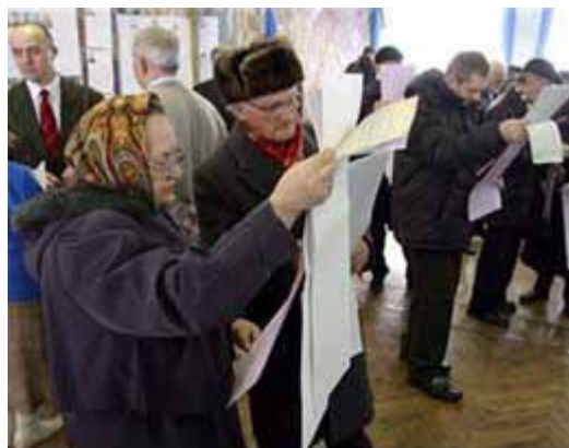
Above: A crowd gathers at a Kyiv polling station to study their ballots before voting. From pensioners to businessmen, there was no doubt that this was an election for the individual Ukrainian.