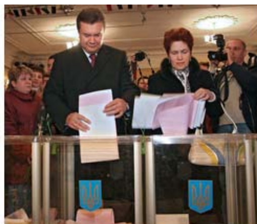
Above: Viktor Yanukovich, former prime minister and leader of the front-running Party of Regions, and his wife Lyudmila cast their votes at a polling station in Kyiv.