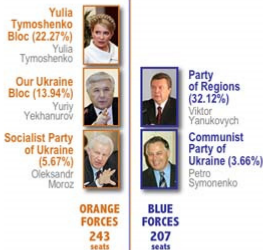
Top: A representation of the Verkhovna Rada floor shows party alignments based on the election results.